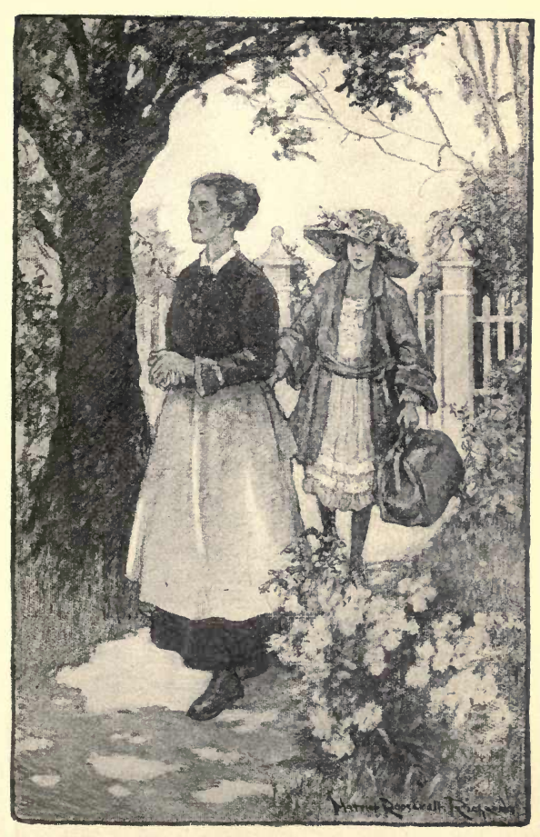
APRIL FOLLOWED MISS MANNY'S UNFRIENDLY BACK UP THE PATH TO THE PORCH